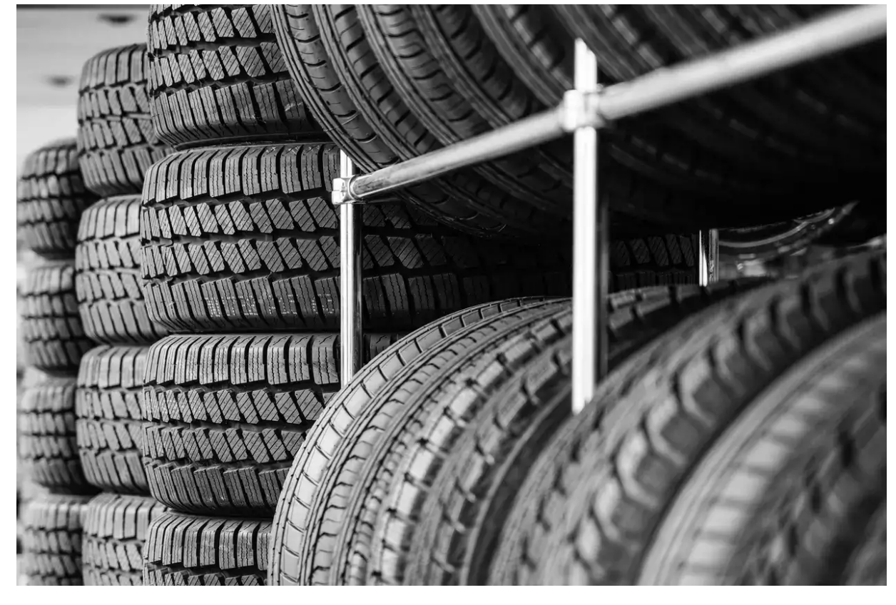
The expansion ensures that Ceat is well-positioned to meet the growing demands of high-performance vehicles both in the domestic and international markets, the tyre maker said.

Car Tyres: Ceat commissions new line at Chennai plant to produce truck, bus radial tyres, ET Auto