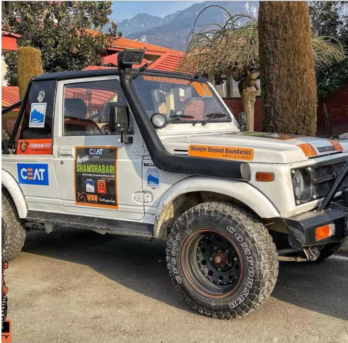
The fleet will comprise about 9 vehicles and a total team size of 25 participants from various parts of the country. The vehicles will include the Thar, Fortuner and Gypsy, - a locally hired mixed convoy.

New Delhi: India's leading tyre manufacturer, CEAT Tyres today partnered with Wander Beyond Boundaries (WBB) to organise two 4x4 extreme terrain driving expeditions called 'Zanskar & Beyond' to promote responsible and sustainable travel.