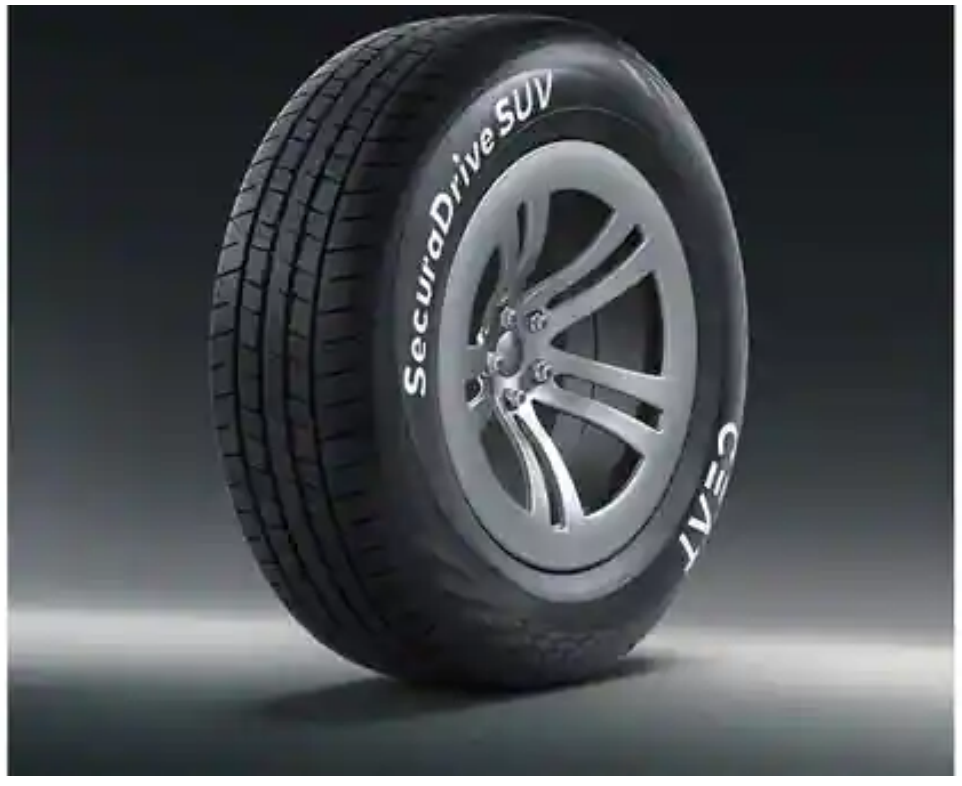
Home > Auto > News > CEAT drives in 'SecuraDrive' range of tyres for compact SUVs in India

CEAT's new tyre range will be initially made available across all CEAT Shoppes in the country.