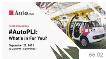
#AutoPLI: What's in For You?