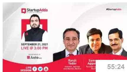
How EV financing is shaping in India?